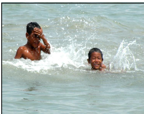
Beating the summer heat

Yek yio oi hon ruhto mikalonre to nup scheme nup vacancies inre ngaich ko-oren oi Visit RKC.