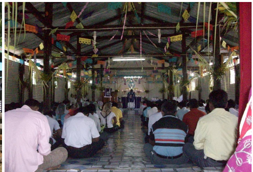
Saint's Day was celebrated at Kalasi Village, Teressa Island on 12th March 2011