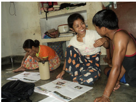
Villagers of Munak Village, Kamorta reading 'Hamara Nicobar'

VOL. II :: ISSUE: 2 :: MAY 2011 :: PAGES: 6