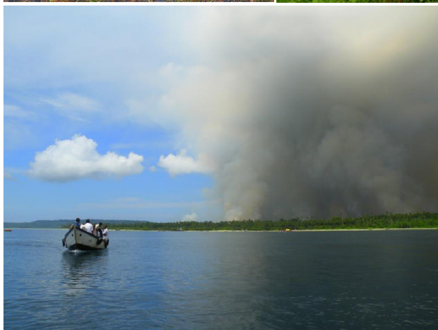
Smoke seen above Teressa Island on the occasion of Grass Burning Festival