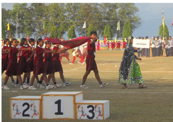
March past on the last day of XVth State School Games 2011. Report on Page 6